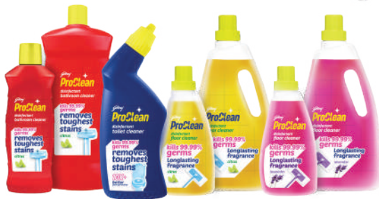
(Top) Our range of Godrej protekt home and personal hygiene products in India (Left) The new Godrej ProClean brand of toilet cleaners in India