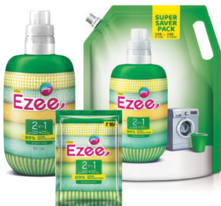
Our dual benefit products in Godrej aer and Ezee