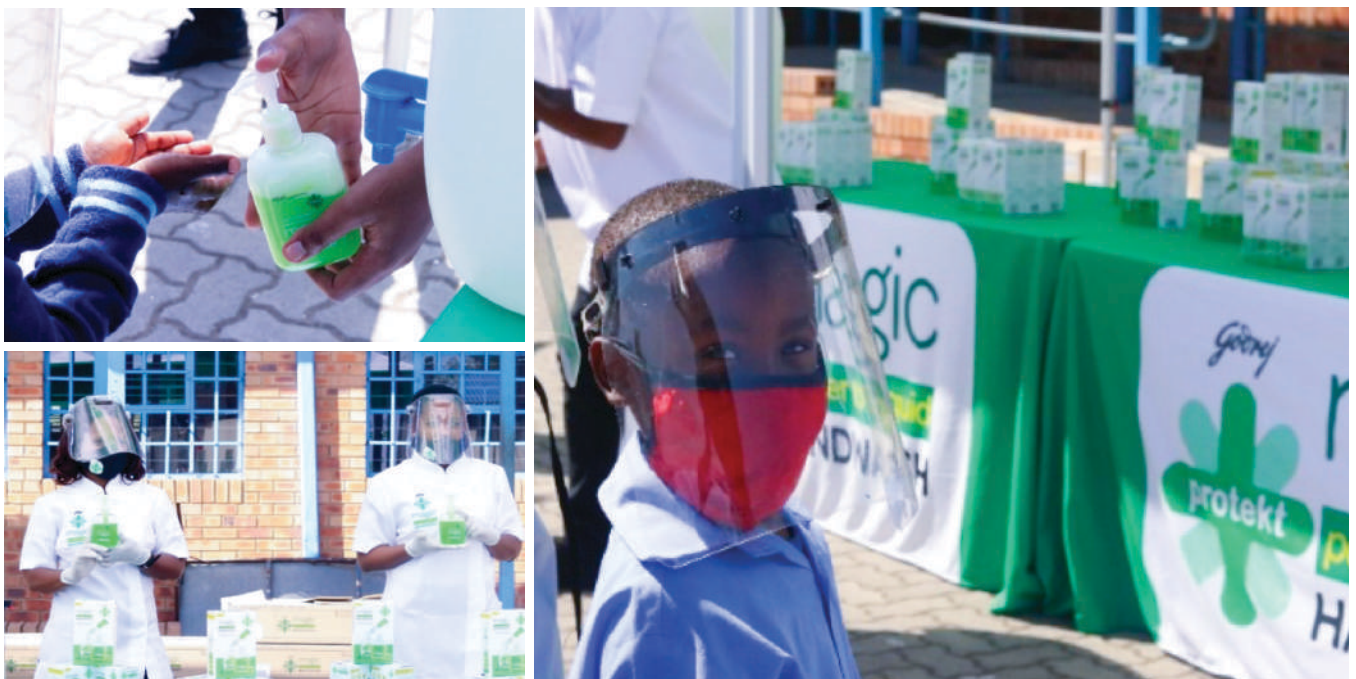
Using our Magic hand wash to build awareness on the importance of handwashing among school children in South Africa

Though these are early days, we are already starting to see benefits. We are also relooking at how to make the operating models for each of our geographies more efficient. You will see us put many other such building blocks in place, including a more comprehensive go-to-market approach, and leverage shared services. Governance is critical and so we have a strong framework to map this and ensure we are building longer-term, sustainable ecosystems.