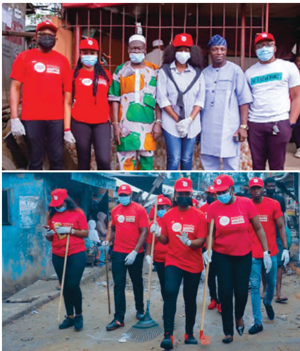
Godrej Nigeria partners with the Nigerian Medical Association and the Lagos state government to encourage people to fight malaria on World Malaria Day