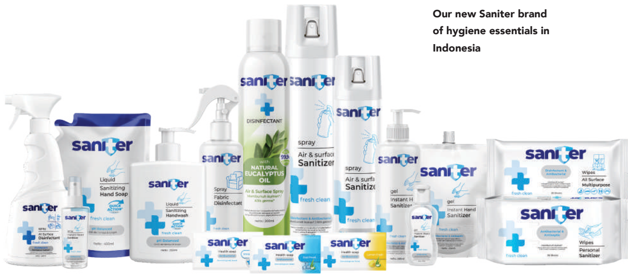
Our new Saniter brand of hygiene essentials in Indonesia

We are also listening more intently to our people on ground, especially in sales and manufacturing. Leadership and decision-making in a crisis has to be distributed. Our big shifts have been possible because our people gave it their 100 per cent, sharing feedback and ideas, and working with agility to capture opportunities. We need to bottle this mojo and make it our new normal.