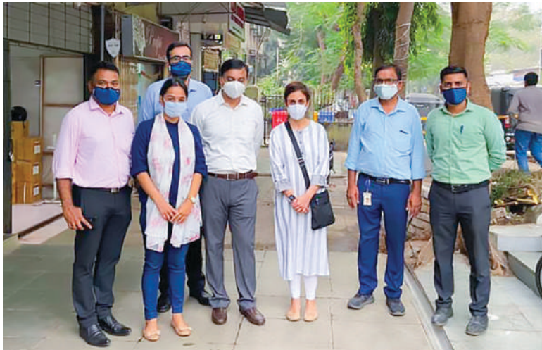
Visiting the market with our team members in Mumbai

The widespread acceleration in digital adoption has propelled our digital ambitions. We are strengthening our e-commerce businesses. In India, we have set up an independent e-commerce business unit with separate P&L accountability and fully functional capabilities across sales, marketing, innovation, and supply chain.